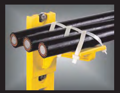
RA08 - 8 arm shown with three cables secured by cable ties.