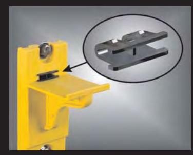
HDL - Arm lock shown with RA04 Arm and CR36-B Stanchion