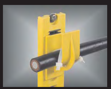
3HDS - 3 throat saddle shown with a cable secured by cable ties.