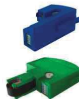
testifire® smoke capsule TS3