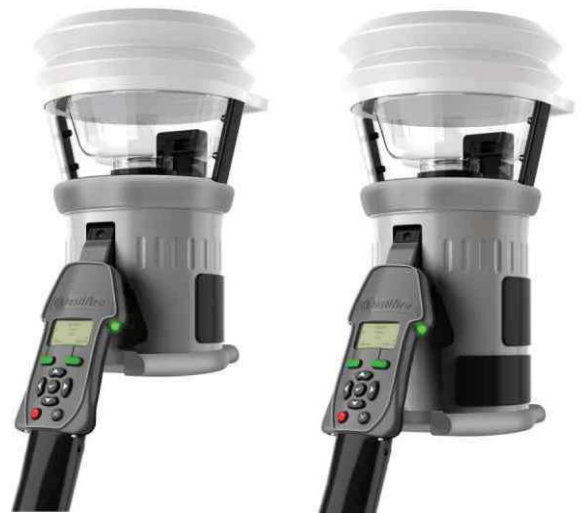
Testifire 1000 Smoke & Heat Testing