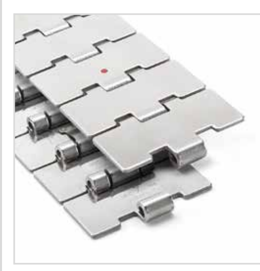
60S 84XM Quick Ling Execution

Standard length: 10 feet - 3.048 m (80 links).