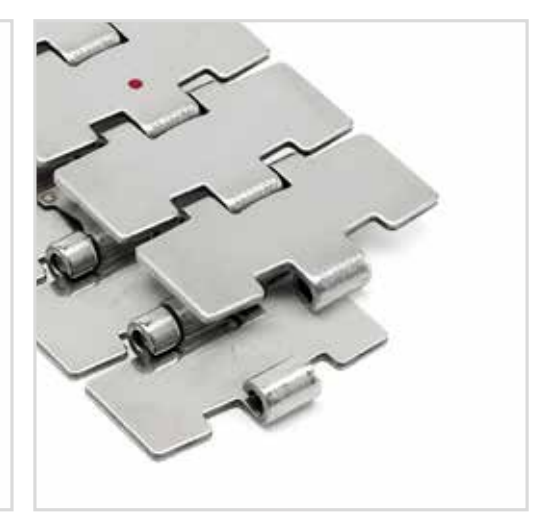
60M 84XM Quick Ling Execution