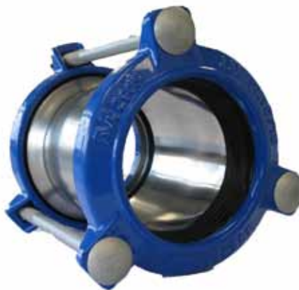
601/A - 053 Bolt Short Stainless Steel Barrel