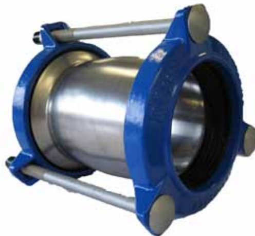
601/A - 043 Bolt Long Stainless Steel Barrel